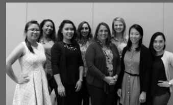
Past CFOT Awardees

The annual fundraiser for the California Foundation for Occupational Therapy (CFOT), held in conjunction with the OTAC Annual Conference & Innovation Expo, again has an online