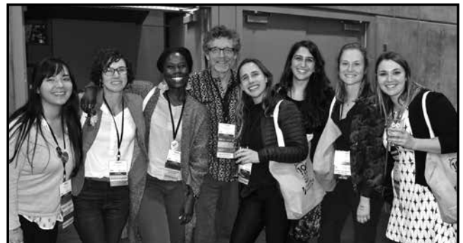
The Many Faces of Past Conferences